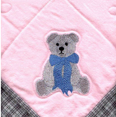
Close-up view of a corner of the Pink Quilt (right).

Layer the backing, batting and quilt top. Baste or pin baste. Machine quilt along the chalk lines, using the dual feed foot. Shadow quilt 1/4" around each embroidered animal. Quilt 1/8" inside and outside each heart applique.